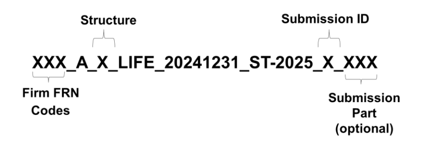
Figure 6: Structure of the .zip file name